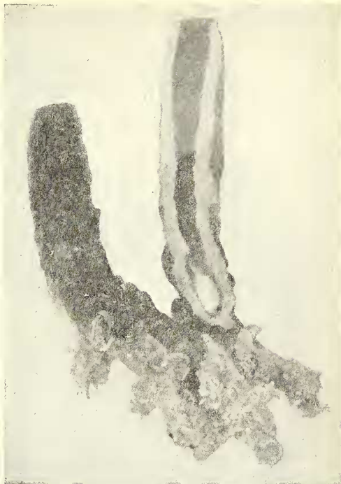
TEXT-FIG. 1. Longitudinal section of a finger or chimney sponge showing a little cardinal fish ( Amia pigmentarius ) in the bottom of such a sponge found in Port-au-Prince Bay, Haiti. After Beebe, 1928.

In 1928, Beebe & Tee-Van published their valuable work "The Fishes of Port-au-Prince Bay, Haiti." As noted above, they found a number of sponge-inquiline fishes of genera recorded earlier herein. However, they described two others to be added to the two already listed. The first is: